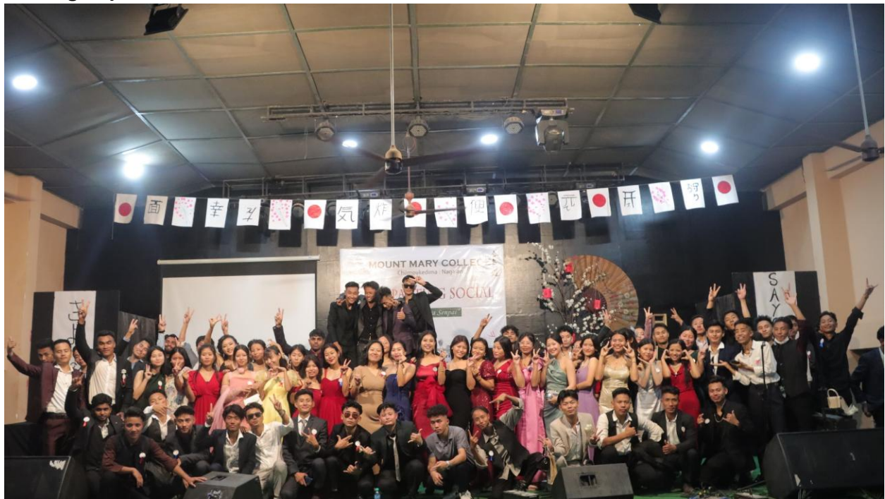
Some glimpses of the Event: